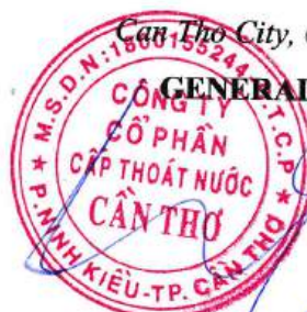
NGUYEN TUNG NGUYEN